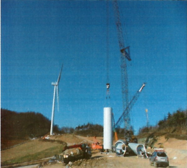
Taebaek Wind Farm 18MW (2011. 08 ~2012. 05 )

Approx. 39,420MWh/year / Reduce 25,714 tons of CO2 for year / 2MW * 9ea / 강원도 태백시 하사미동 일대