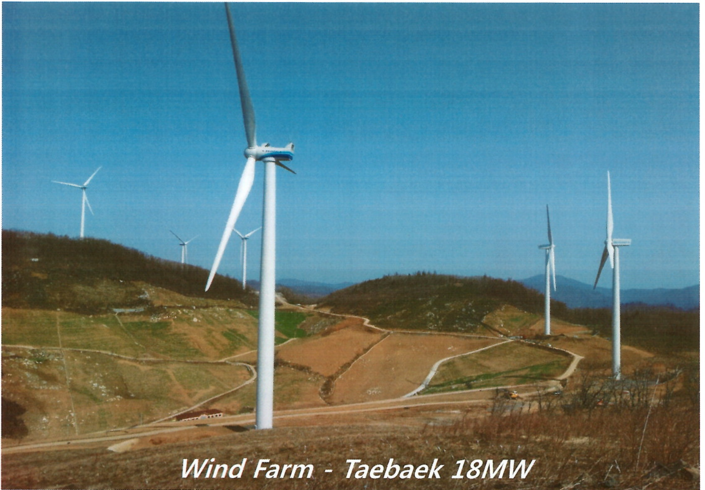
Wind Farm - Taebaek 18MW